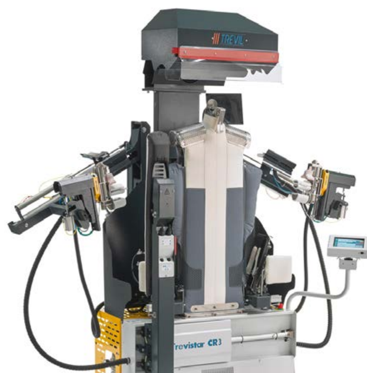
Premium blown air shirt unit