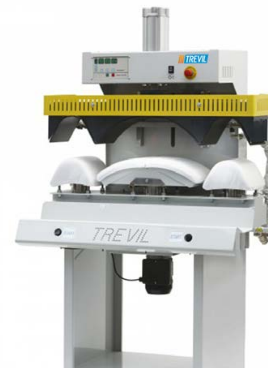
Cuff & collar press